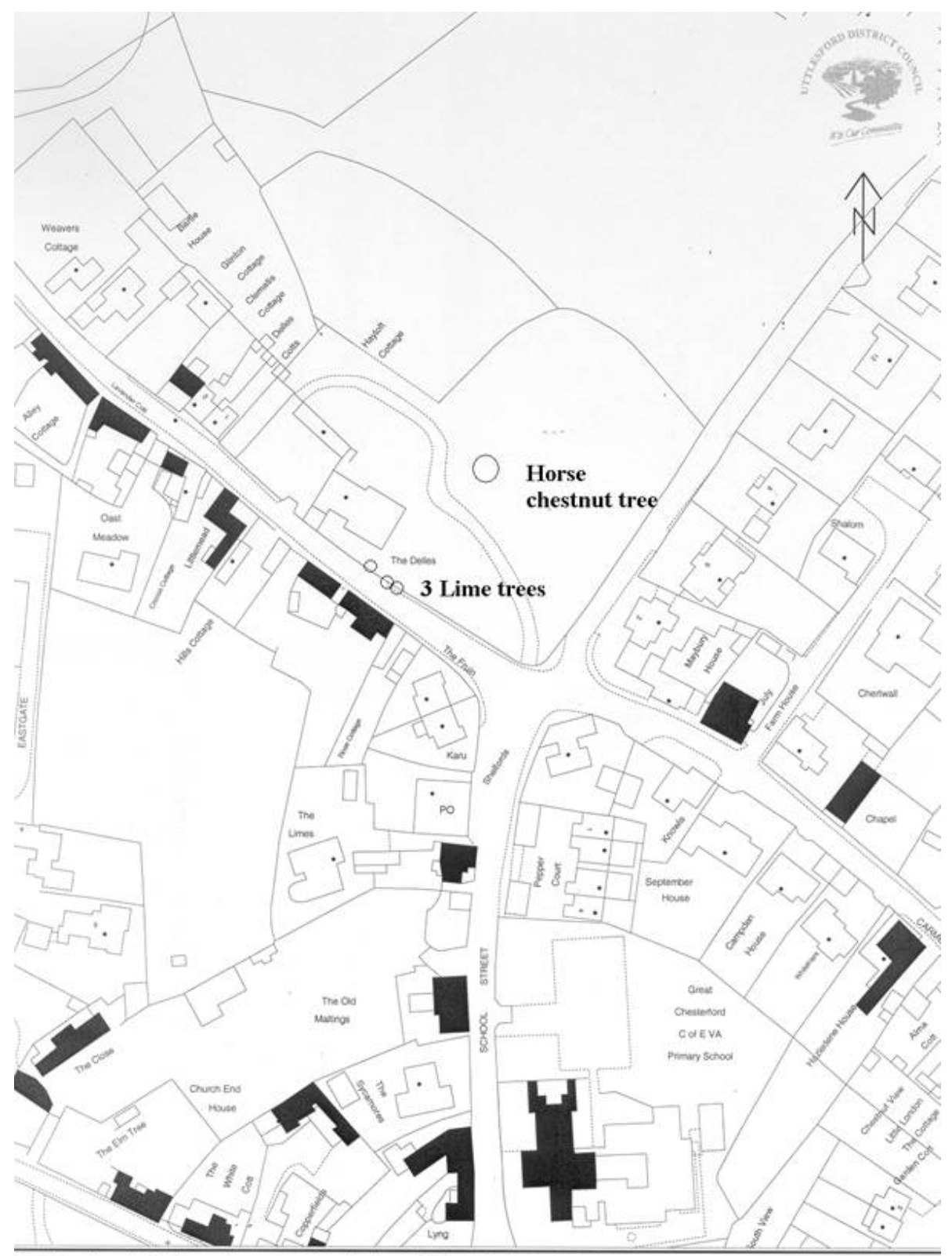
Appendix 1: Location plan